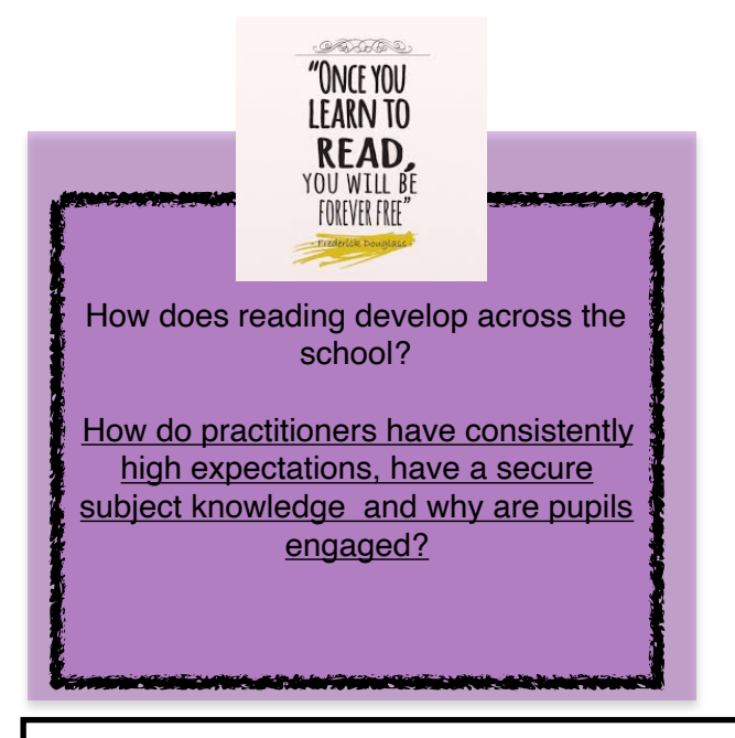
Phase 1: Year One and Two

Children read and understand simple sentences. They use phonic knowledge to decode regular words and read them aloud accurately. They also read some common irregular words. They demonstrate understanding when talking with others about what they have read.