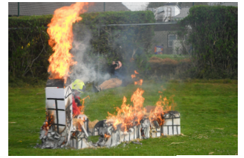
As part of their topic Orange Class (with the help of the Fire Brigade) re-enacted The Great of London on our field this morning .