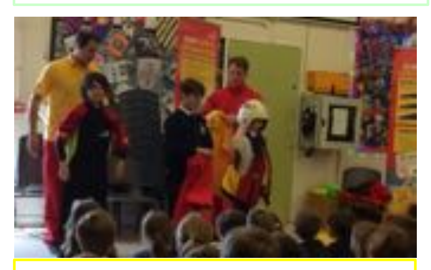
KS2 children had a fun and informative water safety assembly this week.