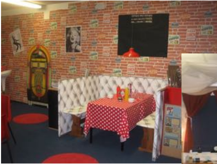
Emerald Class – 1950s theme

Have you seen our new classrooms yet? Here is a sneaky glimpse of some of them in case you haven't!