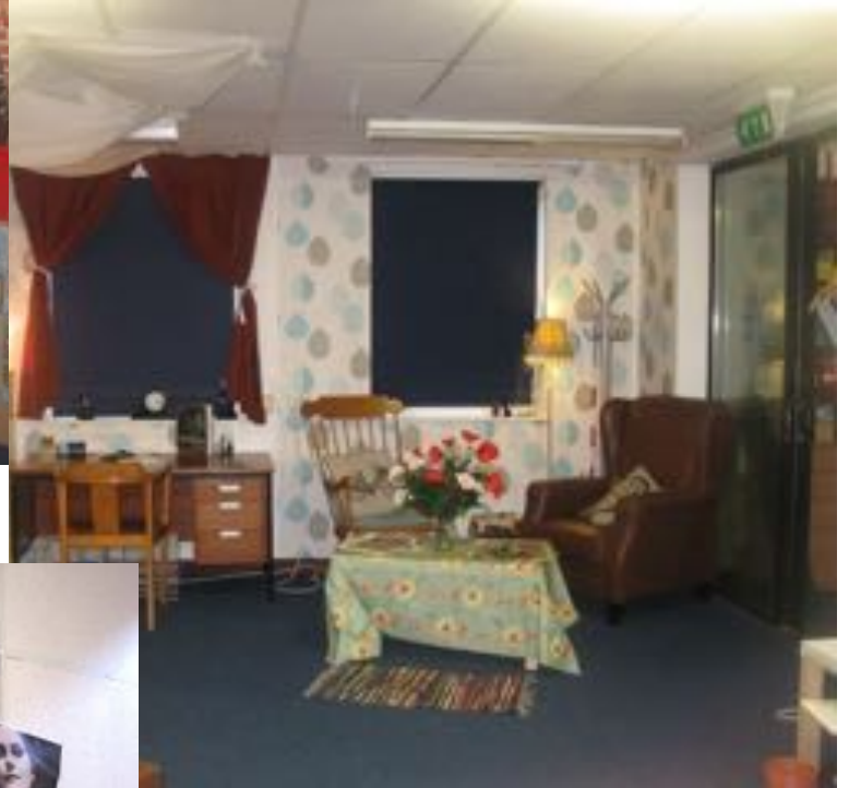
Turquoise Class – 1980s theme