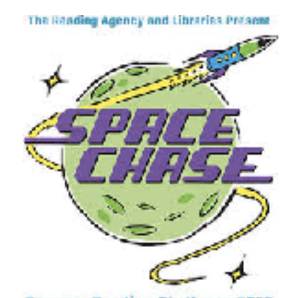
Summer Reading Challenge 2019

read outside the classroom every day are five times more likely to read above the expected level for their age compared to children who never read outside class. Reading will prevent "summer slide" – where a child might forget what they've learned at school in the many weeks off over the holidays.