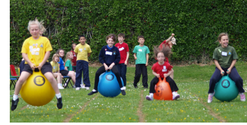
See lots more Sports Day images over the page

Whisper it quietly, but there is an outside chance that we may complete our Sports Days before the end of June! With the Foundation Stage and Years 4 to 6 Sports Days completed and the Years 1 to 3 day scheduled for this coming Monday (24th June) - the traditional game of set a date and wait for the heaven's to open may be avoided this year. Thanks to all of those who have supported the first two Sports Days and well done to all of the children who have competed with such great spirit and boundless enthusiasm so far.