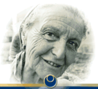
© 2002 Virtues Project International Inc. All rights reserved. www.virtuesproject.com

I am trusting. I have no need to control others. I release fear and worry. I feel at peace and know I am not alone.